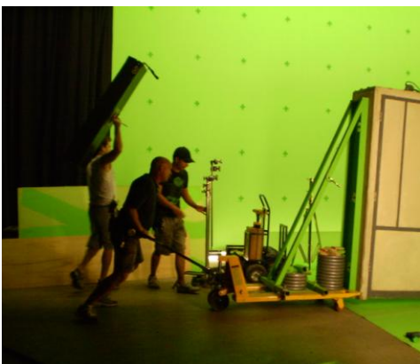
Months working with Green Screen