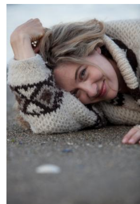
Marilyn Monroe "Sunrise" Nod