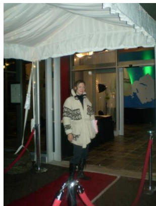
Whistler Film Festival