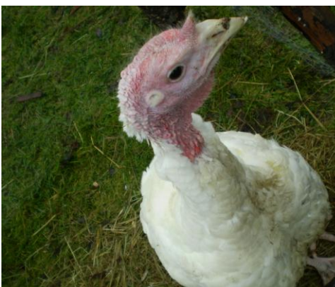
Work with Many Animals on Set