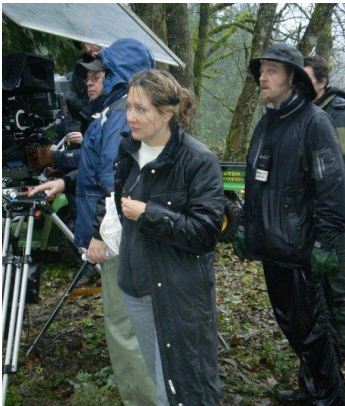
ADing rough conditions