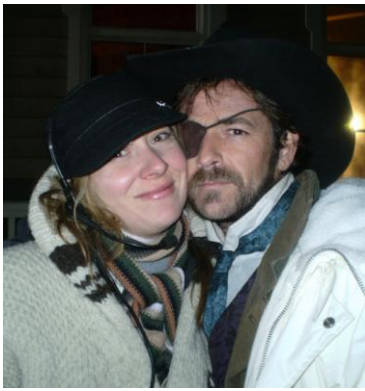
Luke Perry "Angel and the Bad Man"