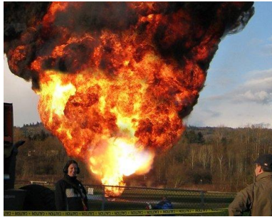
Work with too numerous SFX