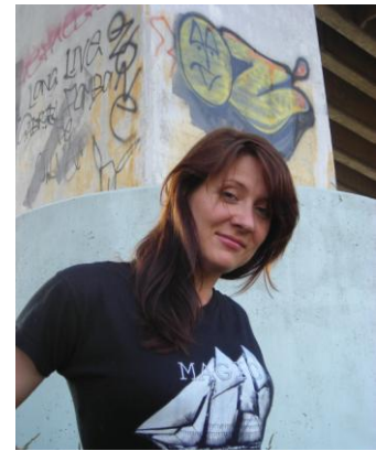
Graffiti painted near Set