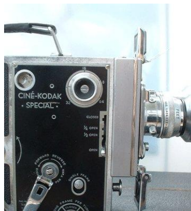
My Favorite Film Camera