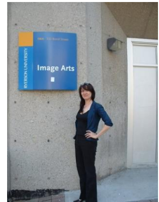
Ryerson University Film Production