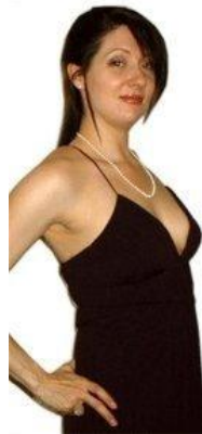
At Awards Ceremony